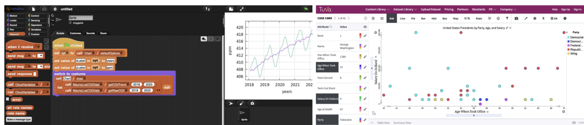
Figure 1: Creation of graph using NetsBlox's inherent blocks ( https://netsblox.org/ ) (left) and creation of graph using Tuva's graphical user interface ( https://tuvalabs.com/ ) (right)